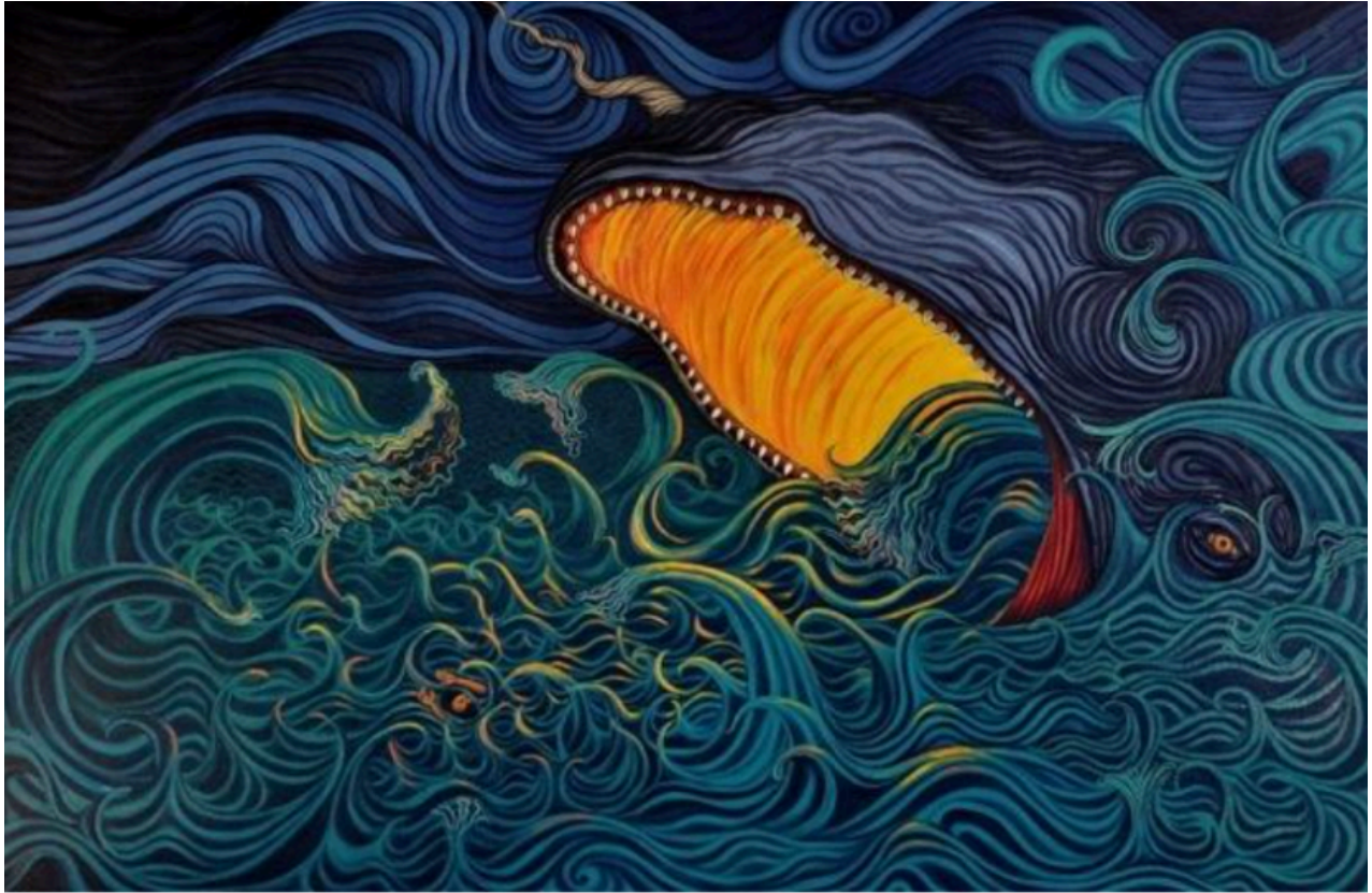
Jonah and the Cave of the Earth, Creator Unknown