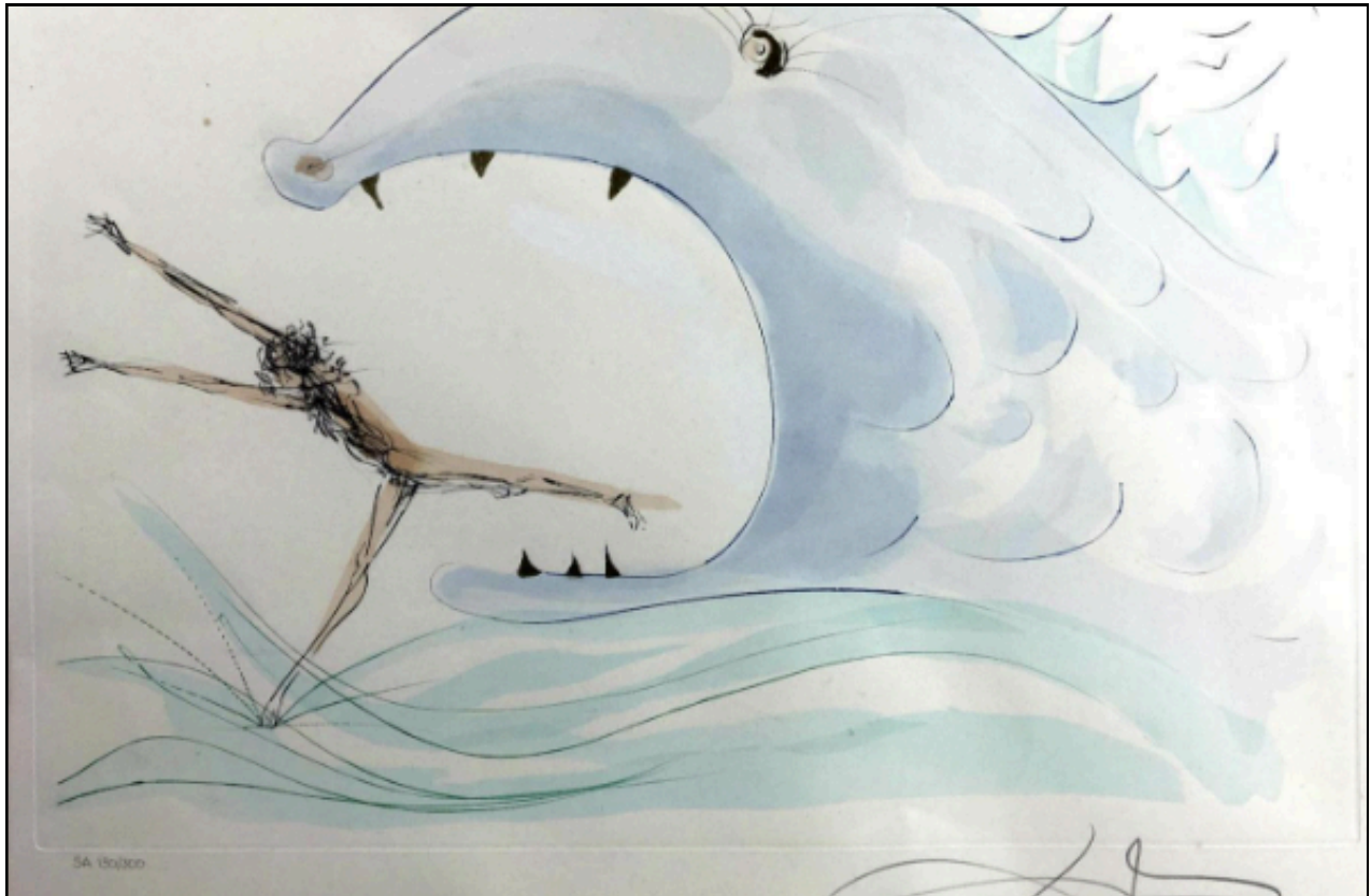
Jonah and the Whale, by Salvador Dali