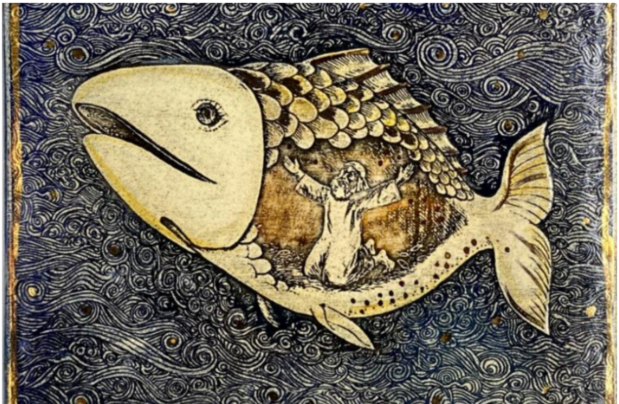
Jonah and the Whale, by Art and Clay Studio