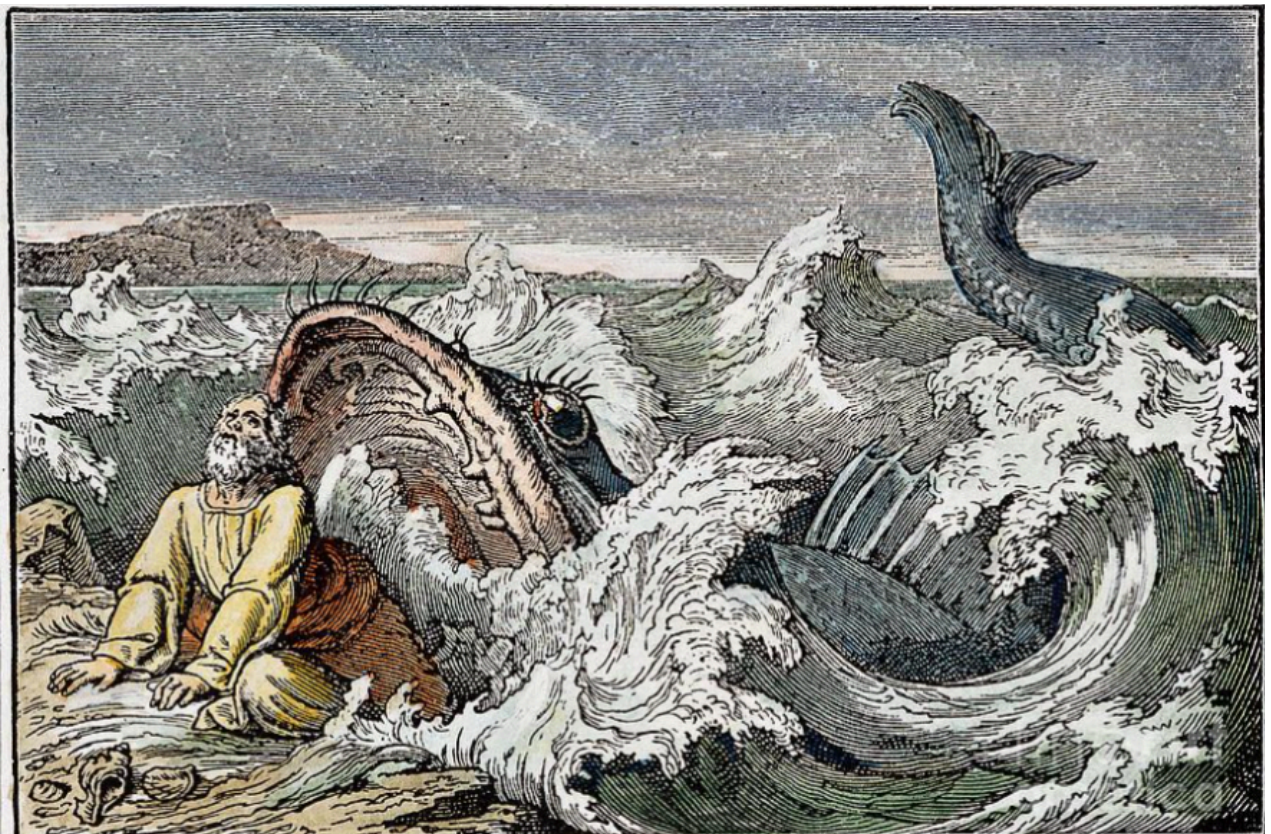
Jonah